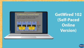
Get Wired 102 Self-Paced (42 hours, $309)