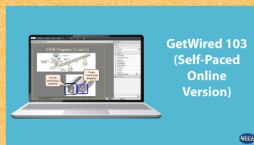
Get Wired 103 Self-Paced (42 hours, $309)

Want to start your journey to an Electrician Trainee Program Certificate on your own time, at your own pace? Choose self-paced.