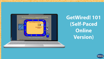
Get Wired 101 Self-Paced (40 hours, $309)