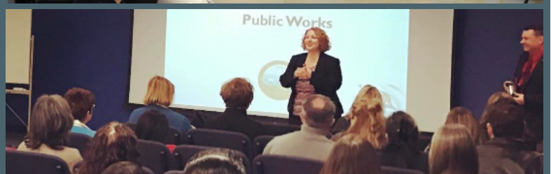
Industry Education Opportunities