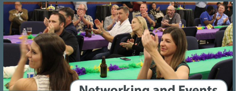
Networking and Events