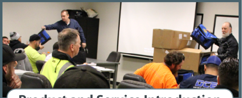
Product and Service Introduction